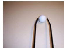
Diagram 4 Level 3 Expert