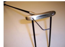
Diagram 5 Tighten Screws